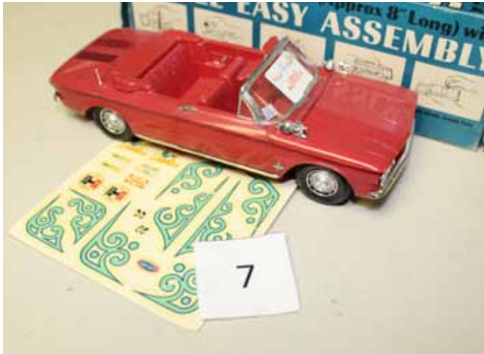
1963 Corvair, 1/25, by Rod Rakos