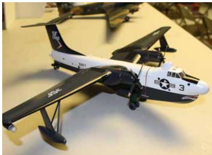
Martin Marlin, 1/72