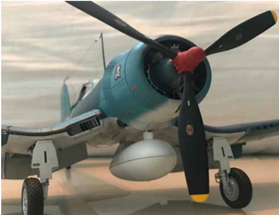
1st Place Aircraft Out of Box, 1/32: F4U-1A Corsair by Mike Turco