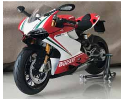
1st Place Motorcycles, all scales: 2013 Ducati 1199 Panigale Tricolore by Mike Turco